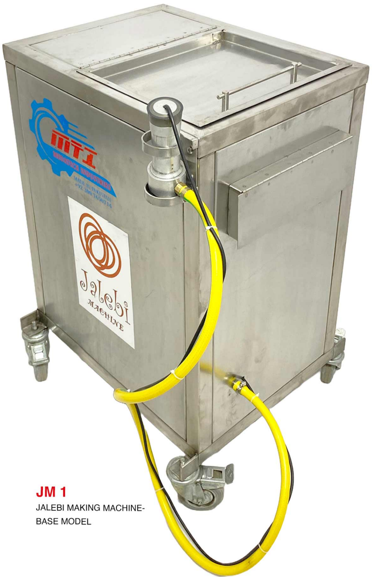
JM 1 JALEBI MAKING MACHINE- BASE MODEL