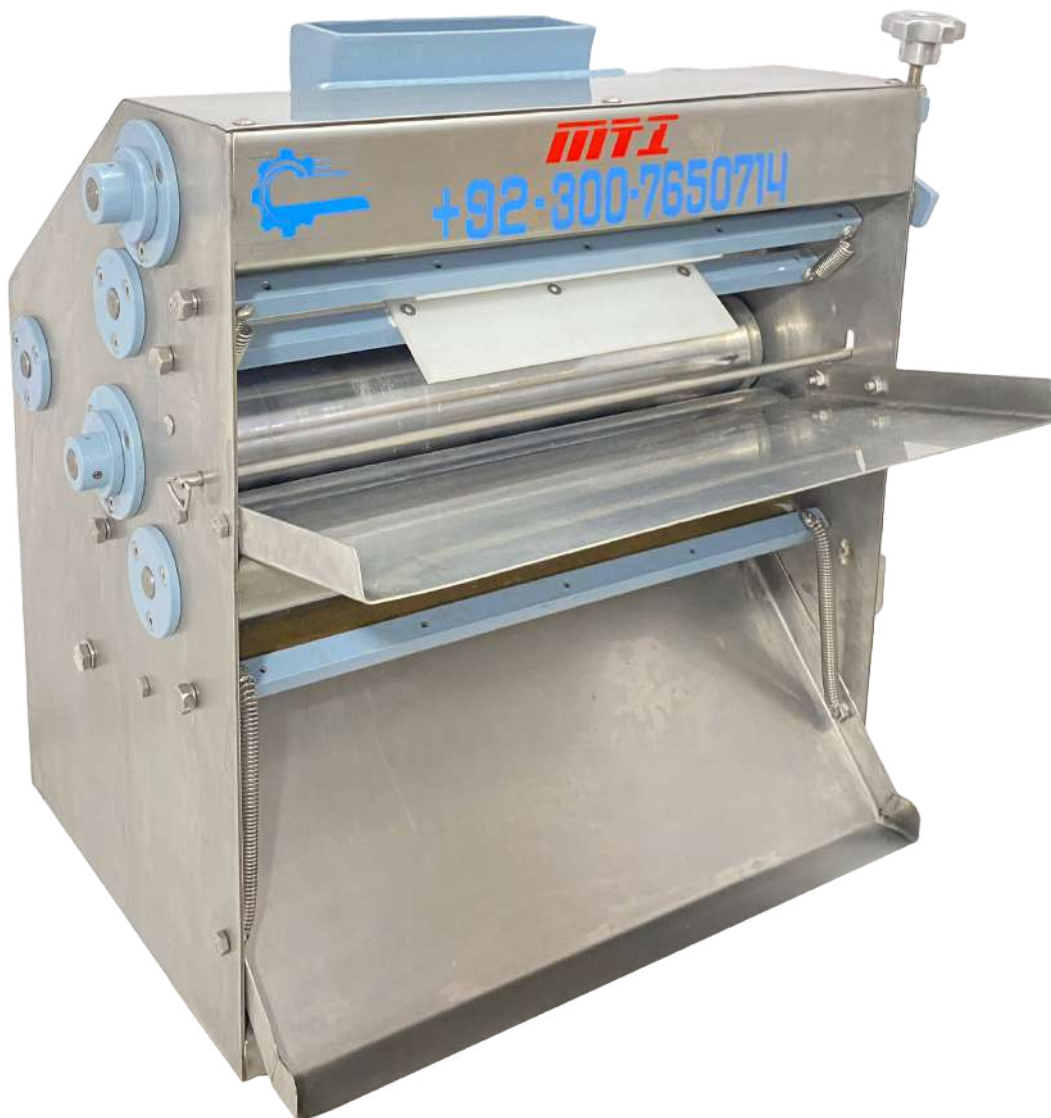
DS 2 - Pizza Dough Sheeter Machine

DESCRIPTION: Machinery used for Sheeting Pizza Dough balls and making round sheets for making samosa. A fully Automatic single-phase stainless-steel machine. All the motors included in this machine are of high quality and are durable as well as reliable with long life. This machine is shipped worldwide. The main objective of this machine is to process and make round sheets by processing pizza dough balls, and and make them into perfectly oval or round sheets without the use of hand for later processing. You just put the dough ball into the hopper and the machine takes care of the rest.