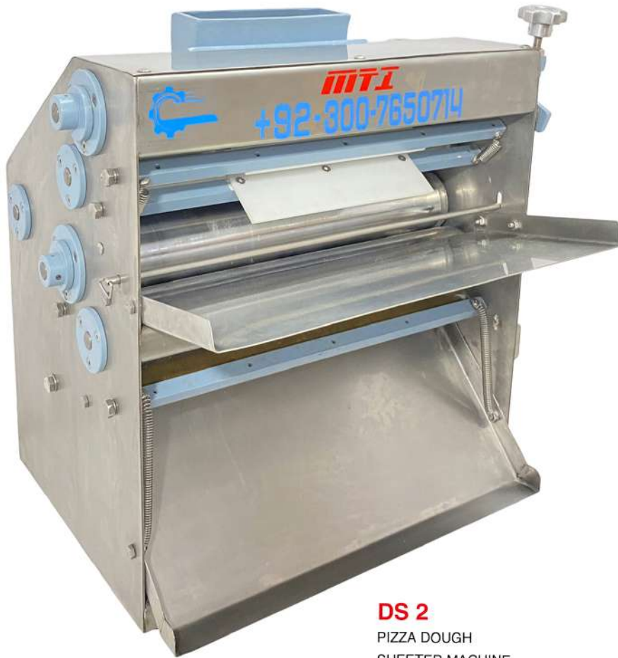
DS 2 PIZZA DOUGH SHEETER MACHINE