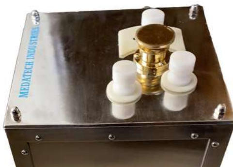
THICKNESS CONTROL KNOB