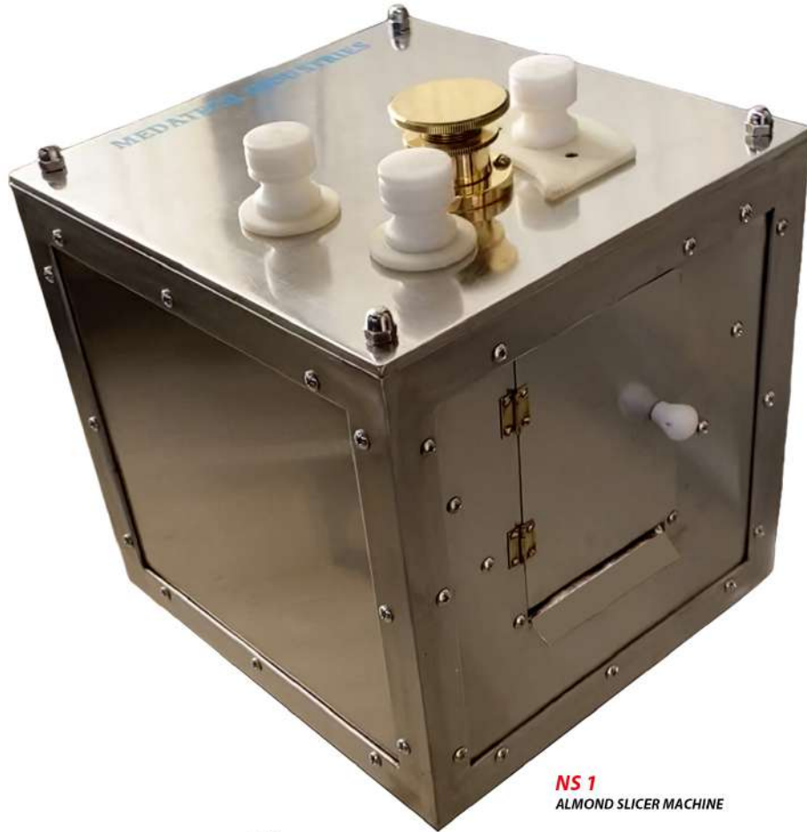
NS 1 ALMOND SLICER MACHINE