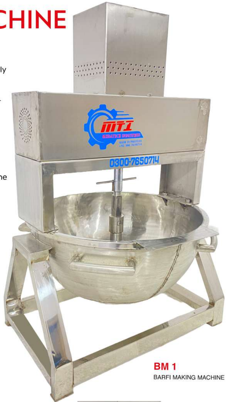
BM 1 BARFI MAKING MACHINE